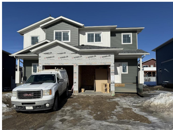
The Oxford II Duplex Unit with basement suite 1,337 s.f./ 1,316 s.f.