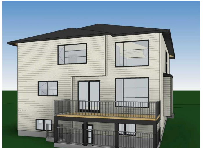
24 N Bridges Glen, Langdon, AB