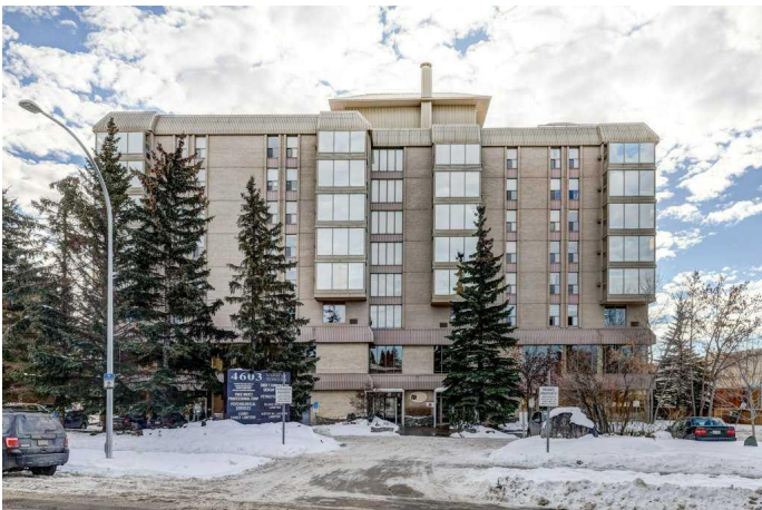
204-4063 Varsity Dr NW, Calgary, AB