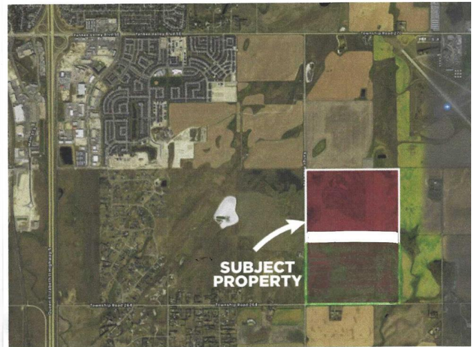
Balzac East Area Structure Plan

160 ACRES OR 64.7 HECTARES RAW LAND INSIDE BALZAC ANNEXATION. SOUTH EAST OF THE CITY OF AIRDRIE AND NEXT TO AIRDRIE AIRPORT. GREAT INVESTMENT LAND OR SUB-DIVISION POTENTIAL. East of Queen Elizabeth 11 Hwy - East on Township Road 270 - 1 km South on Range Road 292. South West of Airdrie Airport.- This land is extremely well situated to benefit from the expansion around it. With each major announcement, the land becomes more valuable. The MD of Rocky View has set records for development in an effort to meet strong real estate demand in the surrounding areas. Environmental Phase One & Site Plan completed