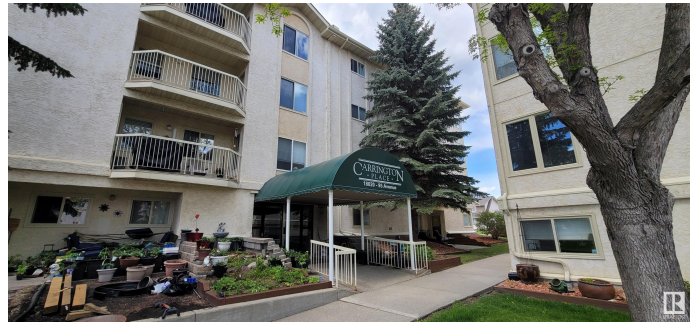
Carrington Place Building C

SUITE TYPE 2 D + DEN 1388 sq ft (1329 sq ft) FLOOR AREAS SHOWN MAY VARY FROM ACTUAL CONSTRUCTED UNITS.