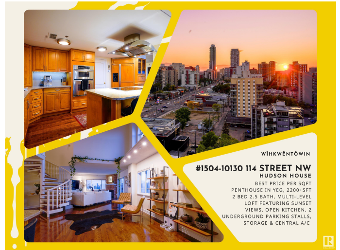
#1504 10130 114 STREET HUDSON HOUSE OLIVER, EDMONTON