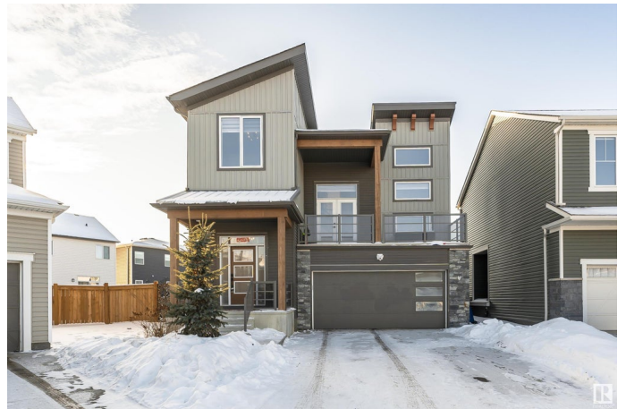
1603 202 St NW, Edmonton, AB