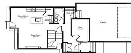
Main Floor Plan 824 sq. ft.

▶ 26' Pocket Two Story ▶ Legal Basement Suite (optional) (1 or 2 bedroom options available)